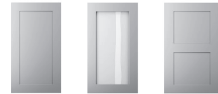
STANDARD DOOR | PLAIN FRAME includes clear glass | CROSS RAIL DOOR